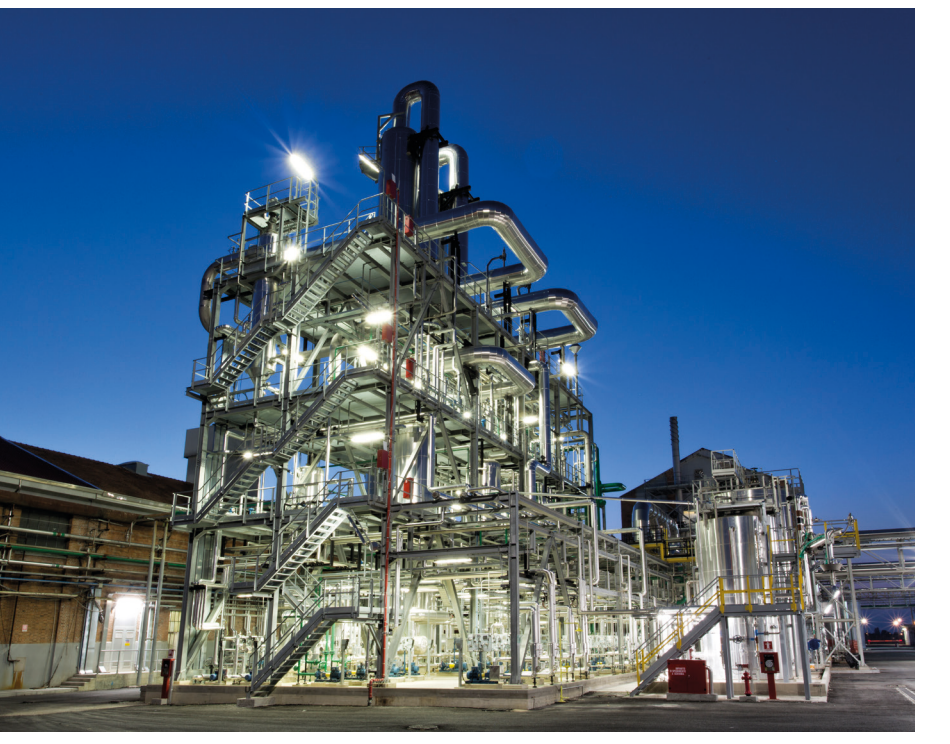
Figure 6 – Novamont third party Mater-Biotech in Veneto Region Figure 7 – Novamont's bio-based, biodegradable and compostable biopolymers

validated into films for non-food packaging applications as well as mulch (see article "Biopolymers and biomaterials applications" in Part 2 for further details).