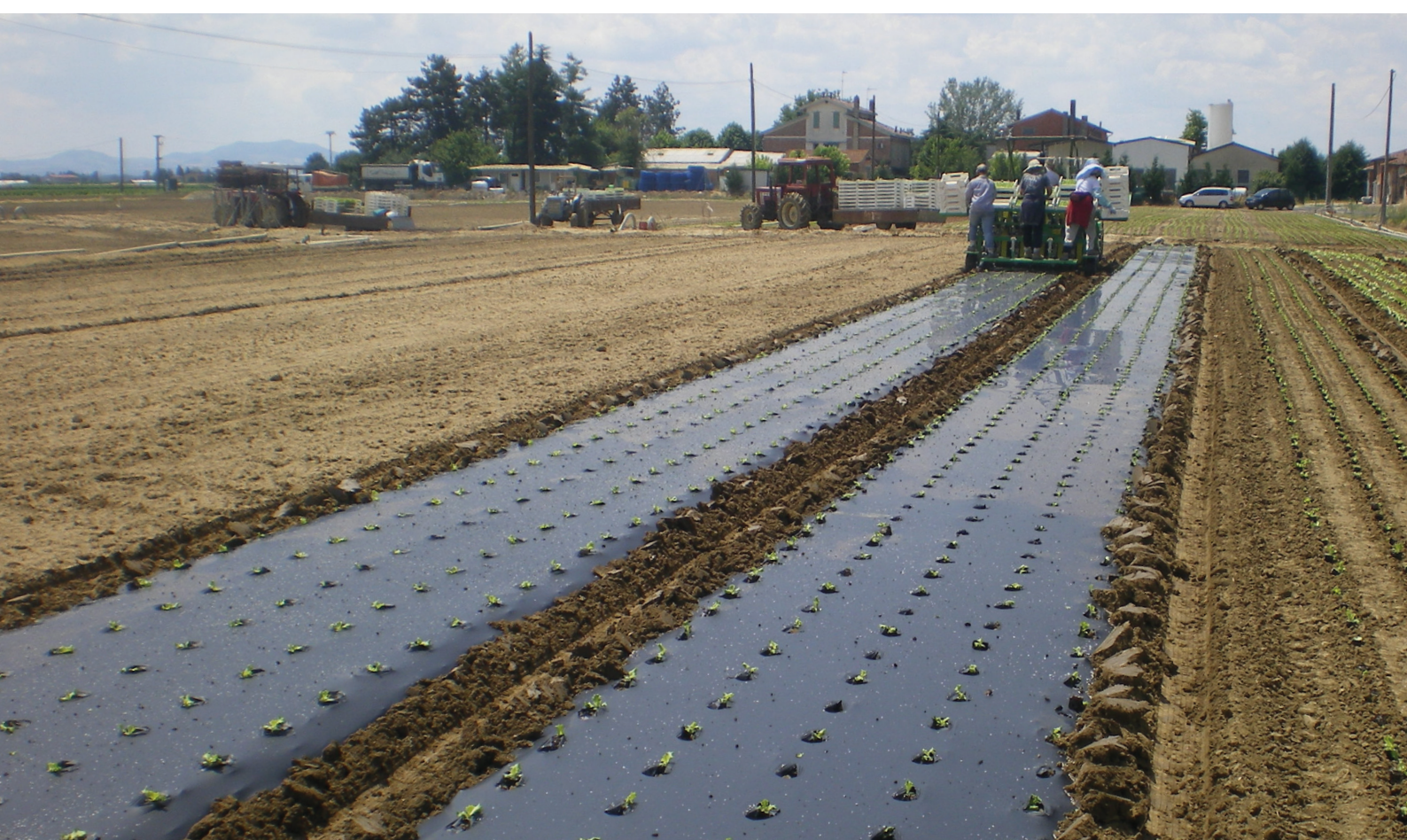
Figure 10 – Mulch film

Fertinagro's role in the Embraced Project is to evaluate the use of raw material from PHB fermentation in the production of fertilizers. Therefore, the PHB fermentation exhausted cells received from Novamont were evaluated and a good nutritional content was founded; with high percentages of macro and micro nutrients that make this a good raw material for fertilizers production. Organic fertilizers are made up of two large groups: compost and biostimulants. Compost fertilizers are those that give structure to the soil and, biostimulants are a group made up of different materials that are characterized by promoting plant growth. Biostimulants are fertilizers with high added value and include amino acids, humic and fulvic acids, seaweed extracts, etc. To see the potential biostimulant capacity of exhausted cells from PHB fermentation, the amino acid composition was also evaluated. It was found that it has a relevant percentage of free amino acids, and some of them with relevance in plant nutrition and resistance to stress. So, the knowledge of amino acids composition will lead us to design a fertilizer focused on early stages of plant development and vegetative growth. In conclusion, these qualities make this raw material of value chain B from project a potential source of important amino acids in the design of fertilizers with relevance in the early biological plants cycle and biostimulant capacity.