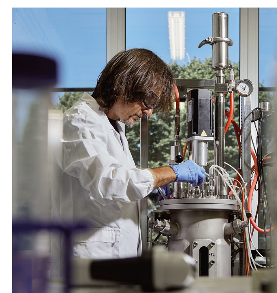
Figure 5 – Lab testing

Contarina, has demonstrated an innovative value chain, successfully converting the cellulosic fraction recovered from AHP waste into sugars then used to produce via a biotechnological process bio-based building blocks for application into biodegradable and compostable bioplastics for different application sectors. Efficient and sustainable protocols for converting AHP waste into bioplastic formulations have been validated through a virtuous integration of biotechnology and chemistry. The conversion of AHP waste cellulose into bio-based building blocks and polymers has been successfully accomplished at progressively increasing scales achieving good results in terms of yield and quality of biopolymers. Novamont has finally scaled-up the value chain processes at demo scale by completing the installation of the process units and their integration at Novamont's premises through its 3rd part Mater-Biotech located in Italy (Bottrighe, Veneto Region). The obtained biopolymers have been also successfully processed into the formulation of biodegradable and compostable biomaterials which have been