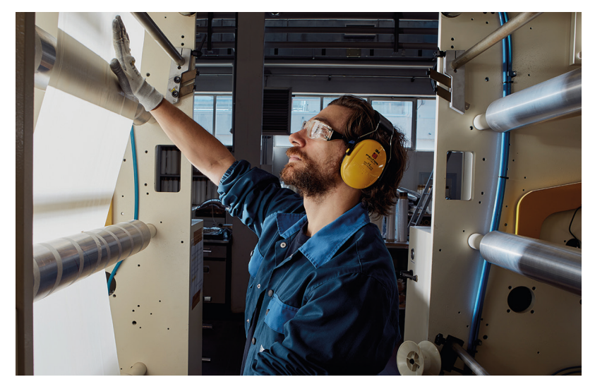
Figure 8 & 9 – Filming

In the EMBRACED project, all the materials and by-products from the AHP waste pre-treatment plant (cellulose, SAP and plastic) and the biorefinery (biopolymers, biomaterials and process co-products) are further processed towards the validation into end products with increased sustainability, competitive cost and relevant market impacts. Within the first two years and a half of the project implementation, the validation into final products has been already finalized for the plastic fraction recovered by the pre-treatment plant, and results have been reported in the first project booklet. In the last two years of the project, the focus has been on the validation of the cellulosic fraction recovered from AHP waste pre-treatment into final products through the biorefinery processes, as described in the following articles.