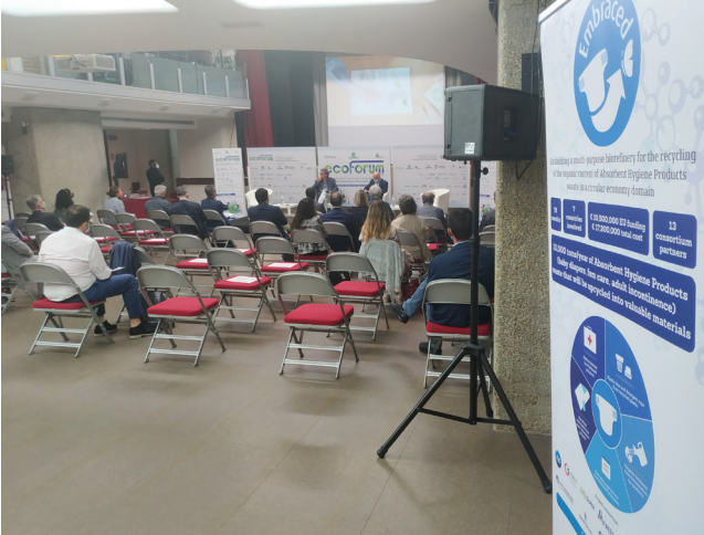
Figure 11 – Ecoforum rifiuti Roma