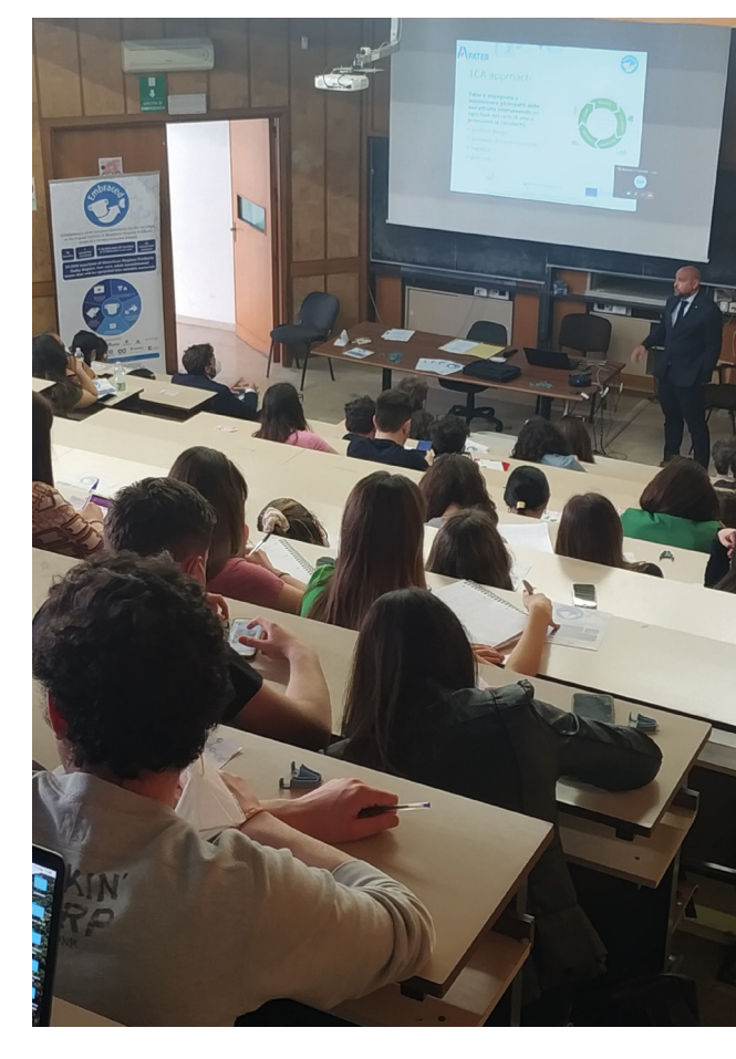
Figure 12 – Seminar at Palermo University

In the afternoon at Cultural Yards in Zisa Legambiente organized another seminary on the correct application of waste management for the transition to the circular economy: the recovery, recycling, and reuse of secondary raw materials from absorbent products in the circular economy model. There were also colleagues of Circe that talked about group dynamics in circular economy.