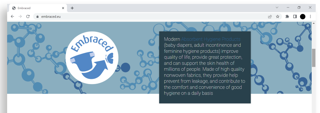
Figure 15 - Cultural Yards in Zisa in Palermo Figure 16 www.embraced.eu

Fater Group website (www.fatergroup.com) also played a relevant role in delivering information to consumers about the experimental diapers' separate collection program in Verona. Edizioni Ambiente constantly supported dissemination activities providing printed and digital copies of EMBRACED leaflet and booklet, as well as roll-up and other graphic materials. Several articles about the project were published in both specialized and popular media, as well as news on local and national TV channels and websites.