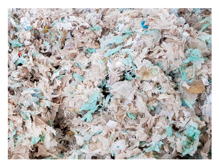
Figure 3 – AHP recycled plastic in sheets form Figure 4 – Separation system