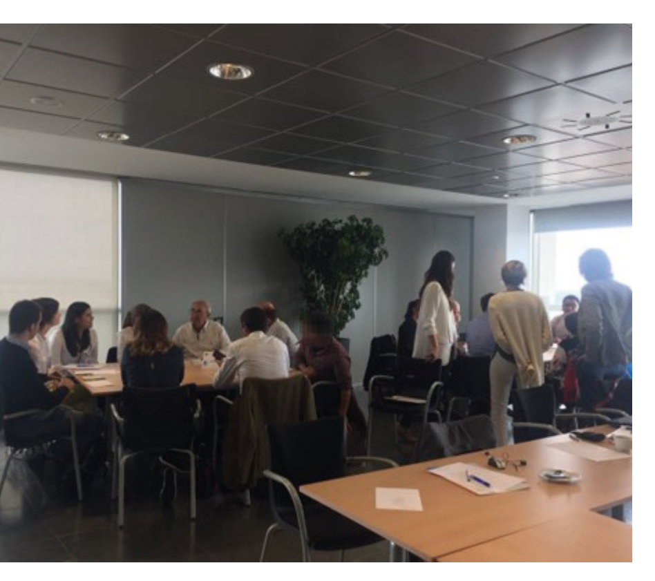
Figure 13 – Workshop Zaragoza Figure 14 – Seminar at Padua University

Complementary information was compiled from people participating in the EMBRACED dissemination events, as an additional source. Information was gathered through debates or quick surveys with the attendants. The workshops have been carried out, involving different stakeholders, like public administrations and businesses, to identify the aspects that affect the social acceptance of bio-based products.