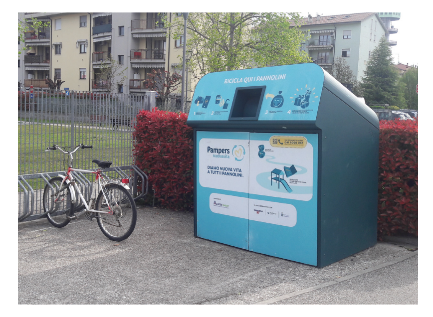
Figure 1 – Smart Bins

We are living in a historical moment in which Europe is moving towards increasingly stringent recycling and circularity targets, and it is necessary to propose innovative recycling schemes also for waste streams that did not previously undergo any process. Regarding the implementation of AHP recycling, a crucial step is the establishment of waste collection services to ensure a stable input flow to the recycling plant. This waste stream is generated both by households and by other relevant producers, such as nursing homes or hospitals. Currently, AHP waste has been rapidly increasing and already accounts for 15 to 25% of residual waste in some territories. Let's begin with the first step of the process: the collection, how is it carried out?